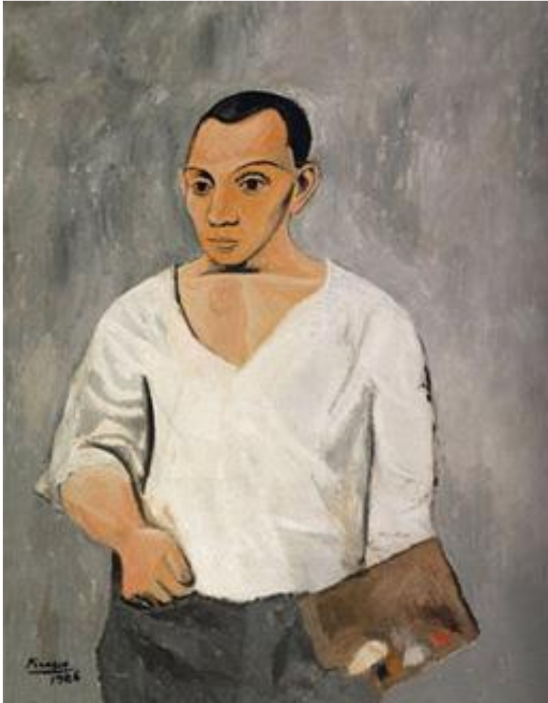
Picasso's self- portrait (at the Museu Picasso)