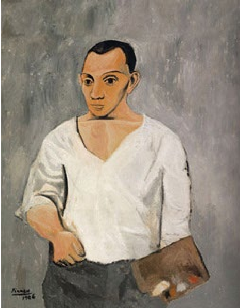
Picasso's self- portrait (at the Museu Picasso)