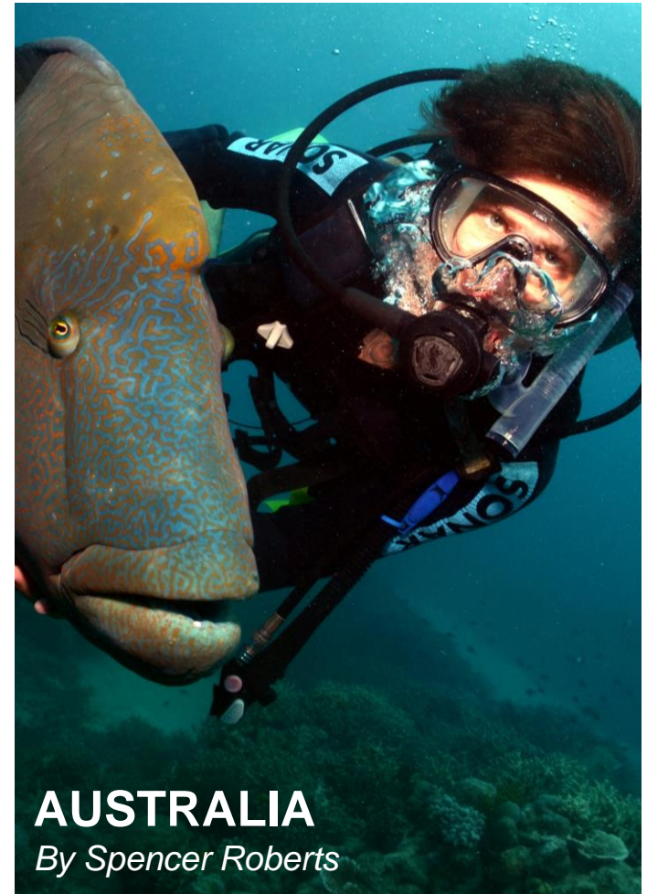
AUSTRALIA